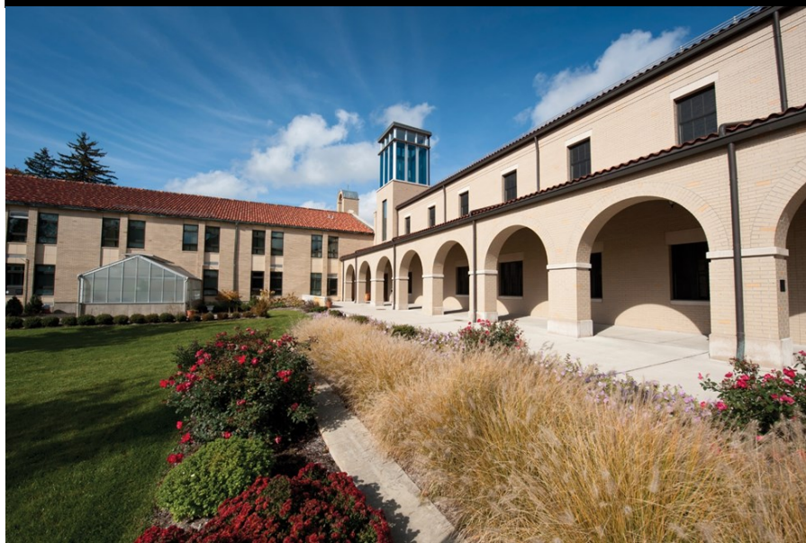
Russell J Ebeid Hall at Lourdes University