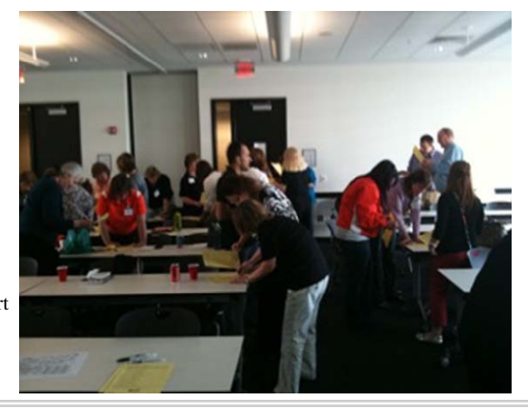
OACRAO Support Staff Day 201 -Ice Breaker

**Our annual Residency Meeting will be held in late July. More information about the meeting will be sent out soon.