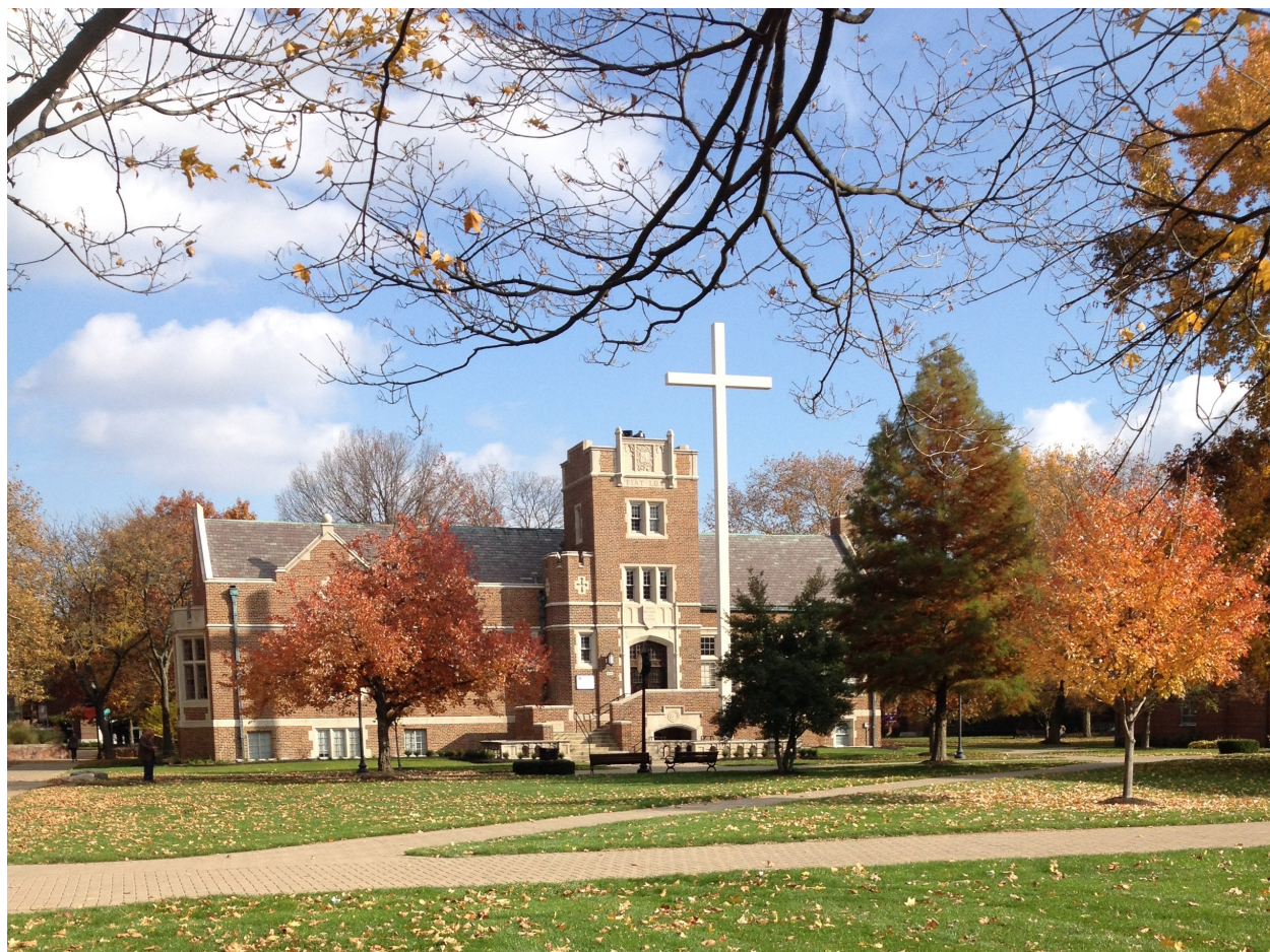
SCENE ON CAMPUS: Capital University located in Bexley, Ohio