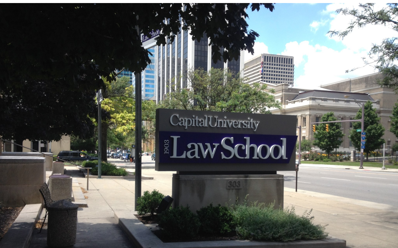
SCENE ON CAMPUS: Capital University Law School located in Columbus, Ohio