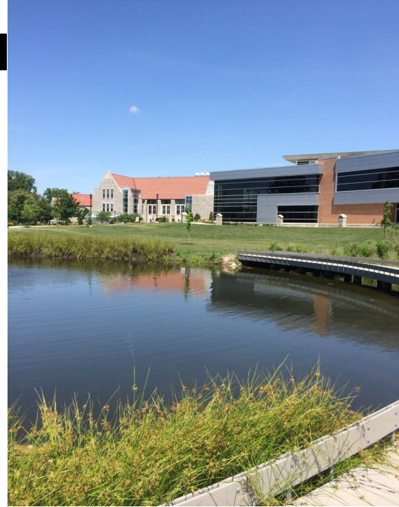
SCENE ON CAMPUS: Heidelberg University located in Tiffin, Ohio

Enjoy the next few weeks. Before we know it, our campuses will be buzzing with students and the arrival of the new fall class. Aaahhh – the start of a new academic year!