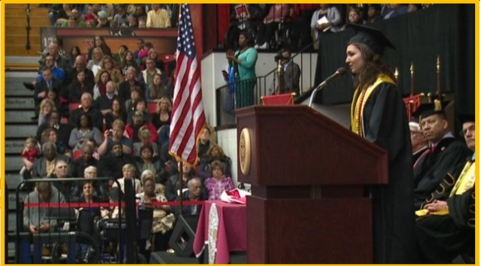
Youngstown State University