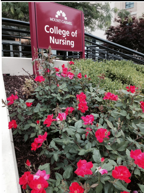
Beautiful roses at Mount Carmel College of Nursing!