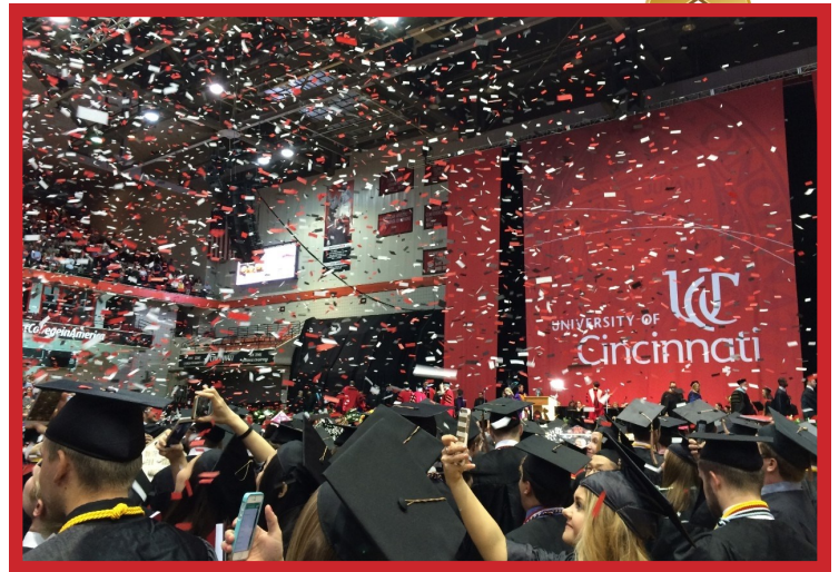
University of Cincinnati