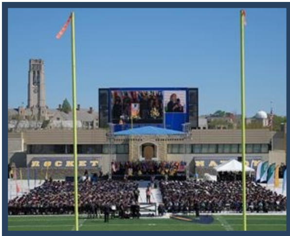
University of Toledo