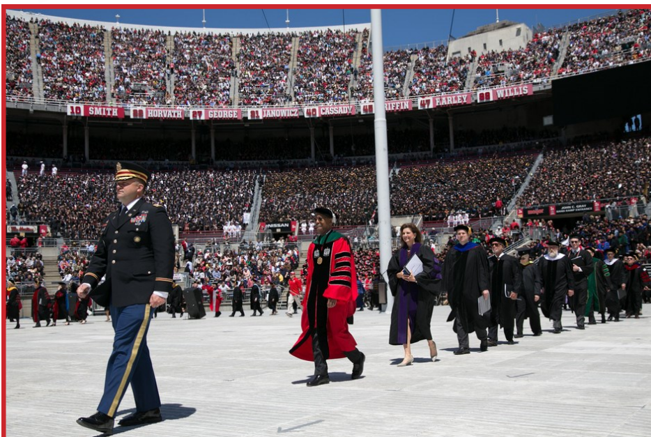
The Ohio State University