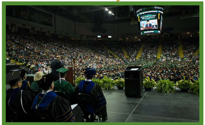
Wright State University