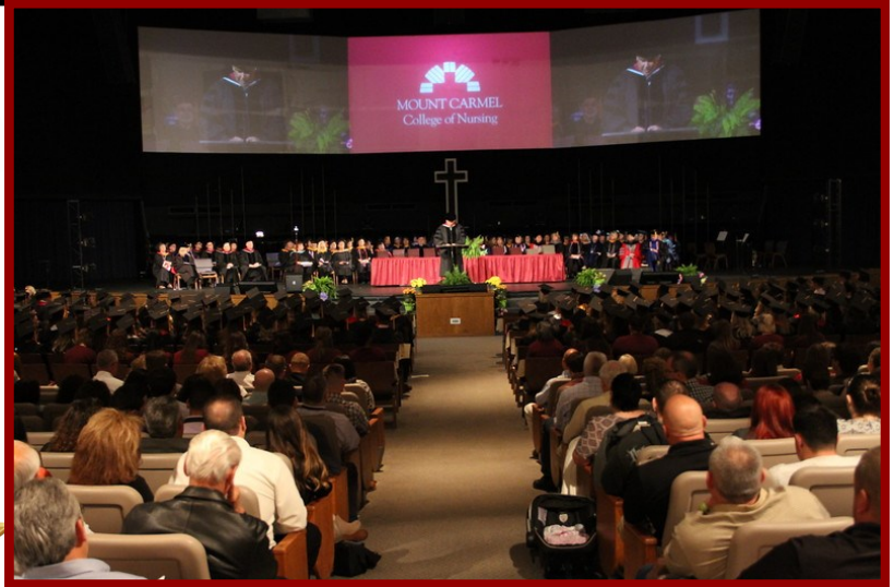
Mount Carmel College of Nursing