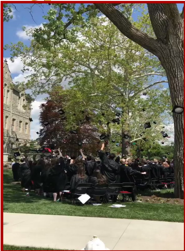
Ohio Wesleyan University