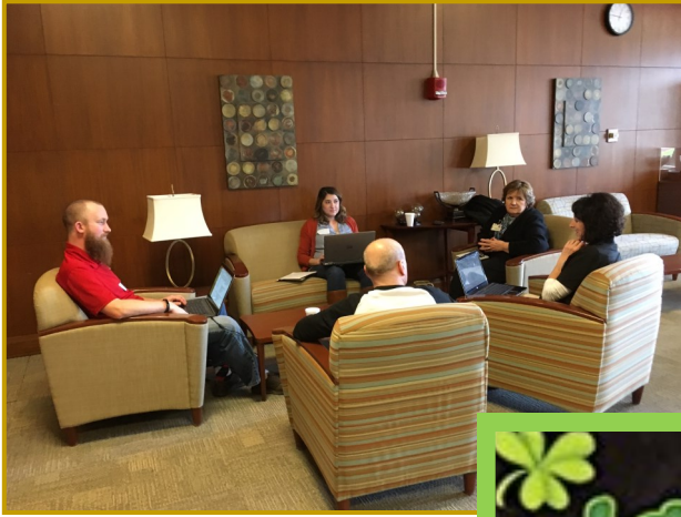
Information Systems & Data Management Committee