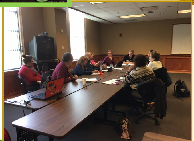
Records and Registration Committee