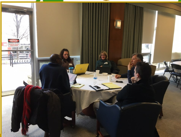
Admissions and International Committee