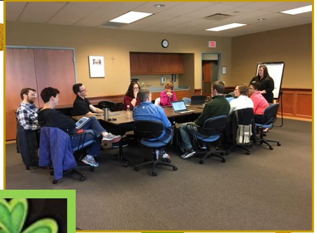
Professional Development Committee