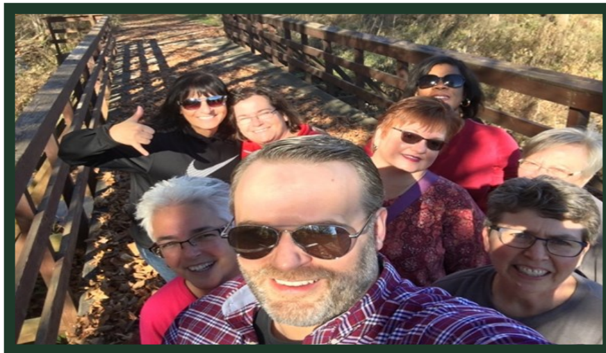
There's always time for a selfie!