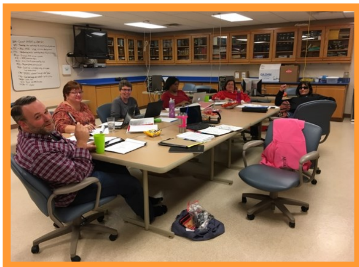
The Board of Directors, hard at work!