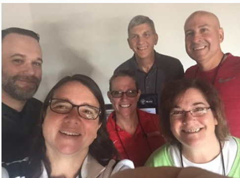
Ohio Summer Institute Faculty