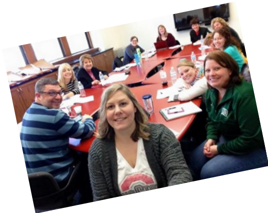
Local Arrangements Committee Planning