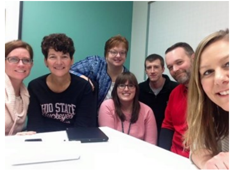
Communications Committee Mtg