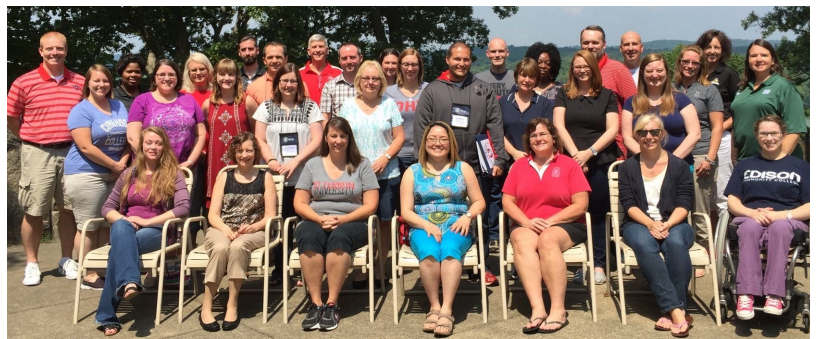
Ohio Summer Institute