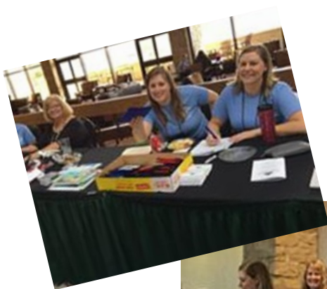
Local Arrangements Doing their Thing!