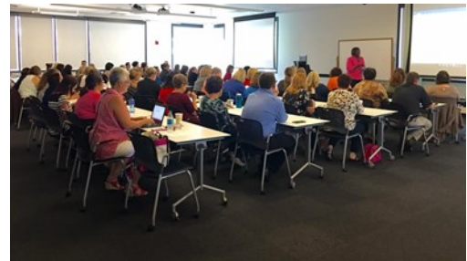
Support Staff Workshop