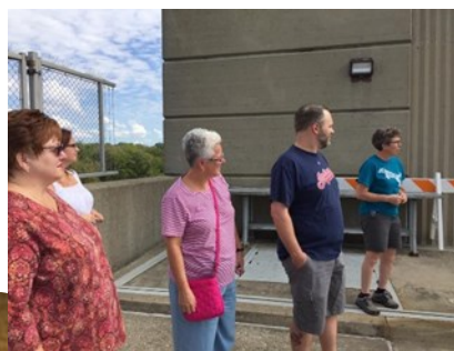
Deer Creek Tour and Stair Climb