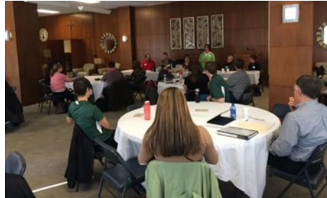
OACRAO Conf. Planning Mtg