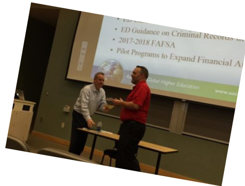
Updates: AACRAO, Federal Relations