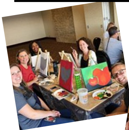
Sip and Paint