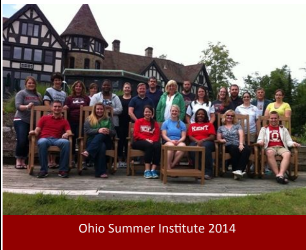
Ohio Summer Institute 2014