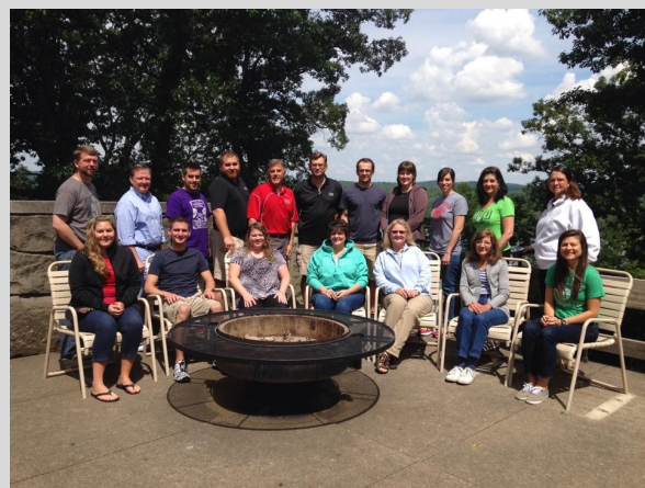
Ohio Summer Institute 2013

Register at https://www.123signup.com/event?id=nggyt or visit the website at http://www.aacrao.org/state-regional-aacrao/ohio/development/oacrao-summer-institute for more details.