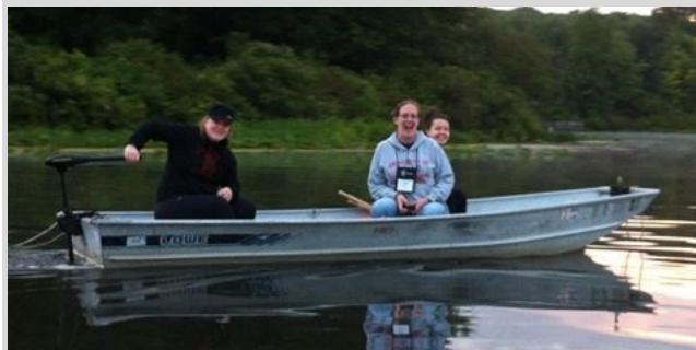
Taking a break!