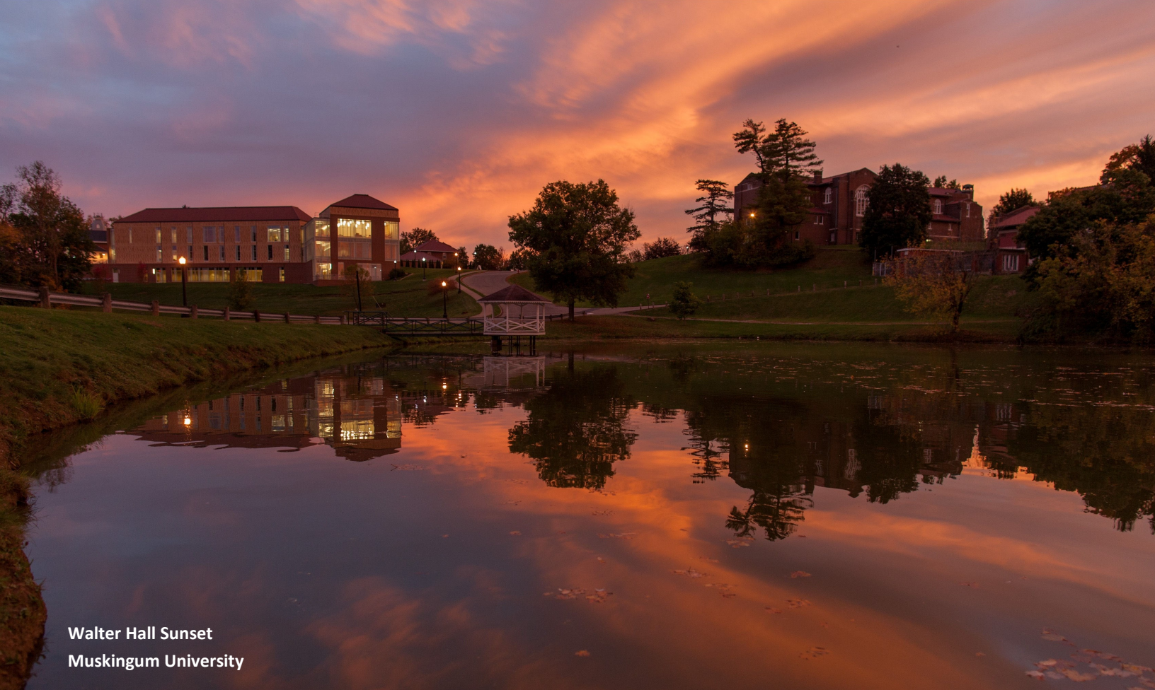
Walter Hall Sunset Muskingum University