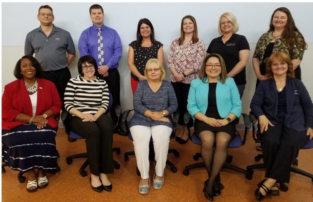
OHIO COMMUNITY COLLEGE REGISTRARS ANNUAL MEETING 2017

Ohio Community OCCR College Registrars Your Standards and Practices Resource