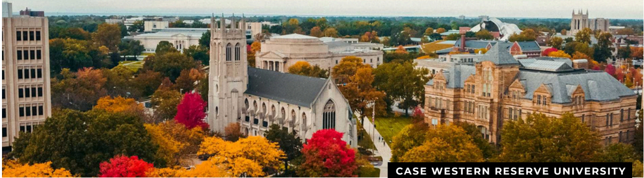
CASE WESTERN RESERVE UNIVERSITY