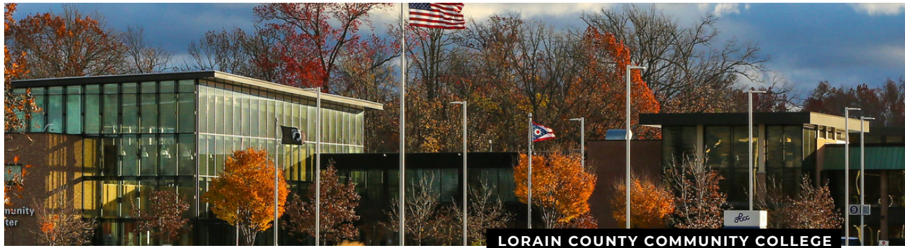
LORAIN COUNTY COMMUNITY COLLEGE