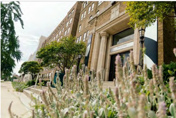
Mercy College of Ohio, Madison Avenue Entrance

Thank you for all that submitting photos to share. We appreciate being able to showcase our campuses while celebrating the OACRAO community.