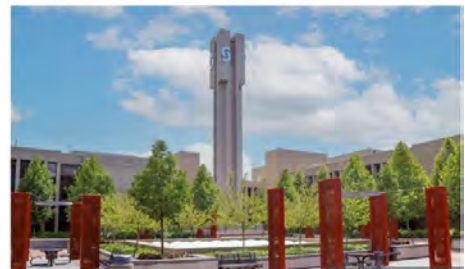
A beautiful day at Sinclair College!