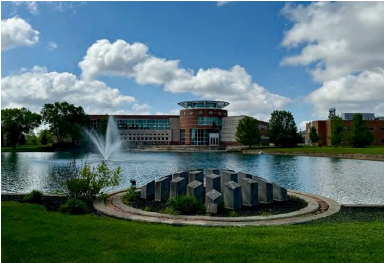
Beautiful day on the beautiful campus of Marion Technical College (MTC).

Thank you for all that submitting photos to share. We appreciate being able to showcase our campuses while celebrating the OACRAO community.