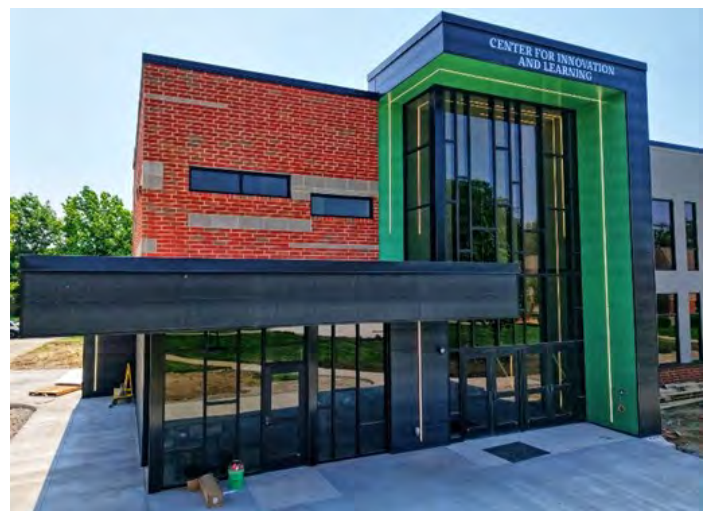
Tiffin University will open a new academic building in August – the Center for Innovation and Learning