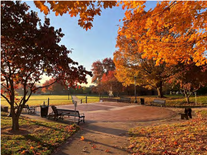
A golden autumn morning at the Belvedere, where vibrant fall colors and warm sunlight welcome a new day at Zane State College.