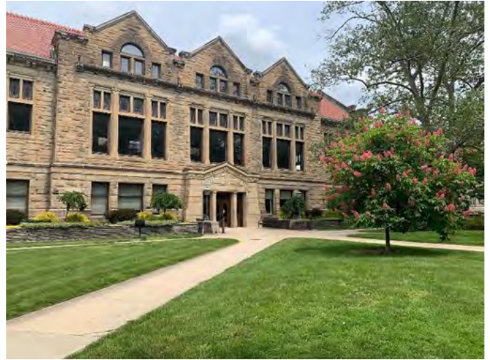
The Carnegie Building at Oberlin College, originally constructed in 1908, served as the main college library until 1974. It now houses the Office of the Registrar.