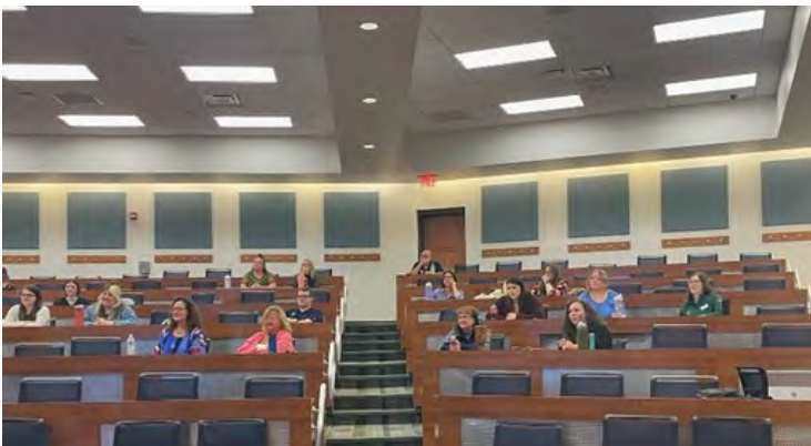
OACRAO Staff Development Workshop Attendees

We had over 30 staff members attend this free event at Marion Technical College, which is offered to employees of OACRAO member institutions. It is designed to support the professional development of Registrar and Enrollment Services staff. The agenda was full and engaging, featuring dynamic speakers and timely topics such as an AACRAO update, workplace ergonomics, the role of AI in higher education, and holistic student support.