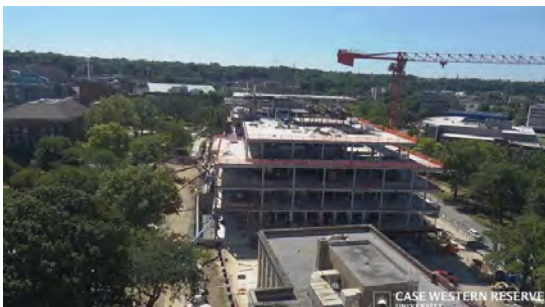
Case Western Reserve’s Interdisciplinary Science and Engineering Building (ISEB) under construction. Expected to open in Fall 2026!