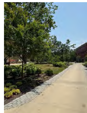
Sunny days on the Case Western quad!